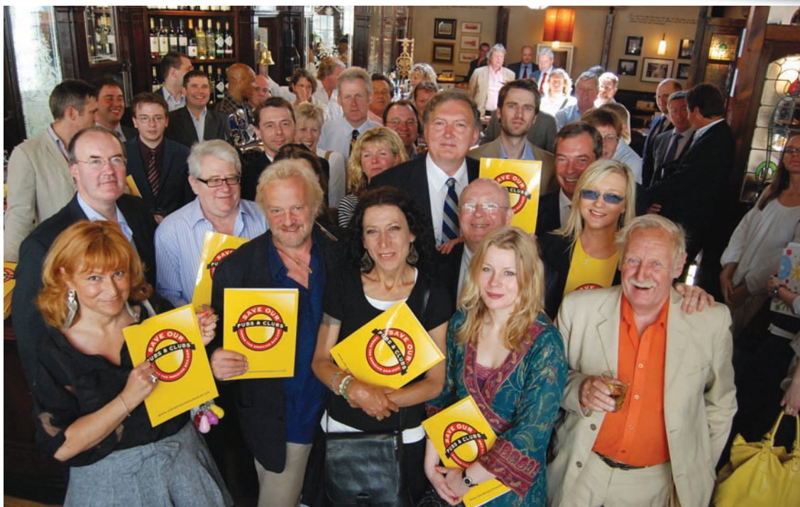
Making a stand: Antony Worrall Thompson with campaigners who believe a blanket smoking ban is unjust

Award-winning celebrity chef Antony Worrall Thompson, patron of the smokers' group Forest and a leading supporter of the campaign, said: "The smoking ban has had an extraordinarily detrimental effect on pubs and clubs and you can understand why. The legislation as it stands is excessive and I